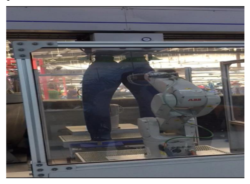
A robot is being used to give finishing touch to the garment

Vietnamese garment industry has adopted a high level of technology and strive to achieve more to increase the production, cost and zero defect product. Factories are using robots to finish the garments.