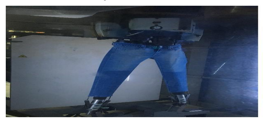
Automation and adopting new technologies is an integral part of the Vietnamese garment industry. Laser technology is being used for giving effects in jeans, this reduces the environmental impact of the industry and increases the productivity

The wash is done using laser which goes across the jeans and burns the wash into them. The process is very quick and the washes look amazing. This water-free technology can give much wanted 'distressed' or 'vintage' look to the denim.