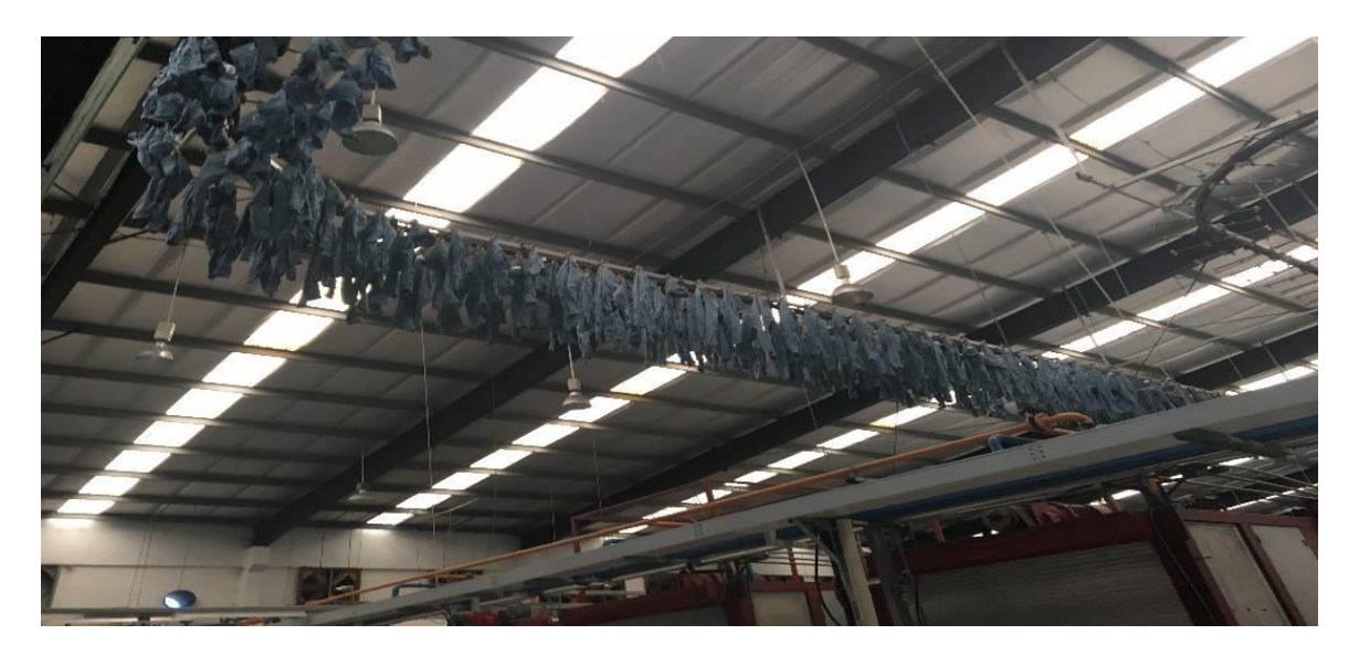
Technologies like Hanger system are being used to dry the garment to reduce the energy conservation